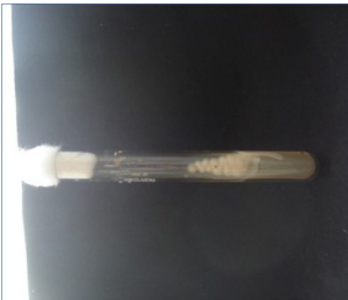
[Table/Fig-1]: Culture of Cryptococcus neoformans showing white to cream, smooth and non-mucoid colonies

Giemsa stained Fine Needle Aspiration Cytology (FNAC) of left supraclavicular lymph node revealed 5-15µm spherical yeast cells with narrow-based budding, scattered lymphocytes and epitheloid cells. The yeast cells were poorly encapsulated, engulfed inside macrophages and present in chains closely resembling pseudo-hyphae. The aspirate of FNAC was subjected to culture on Sabouraud's Dextrose Agar medium (SDA). After 48 hours white to cream, smooth and non-mucoid colonies were isolated [Table/Fig-1]. The growth was identified as Cryptococcus neoformans based on the findings of Gram Stain, biochemical tests (i.e, hydrolysis of Christensen's urea agar, inositol and nitrate assimilation) and negative germ tube test. On India ink preparation yeast cells with a thin, narrow capsule was demonstrated. This was further confirmed by Meyer's mucicarmine stain as it imparted a typical rose burgundy colour to the capsule [Table/Fig-2]. There was no increase in the size of the capsule even when it was sub-cultured in 1% peptone solution and on chocolate agar at 37°C in a CO 2 incubator [1].